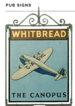
Sign at The Canopus pub in Cookham Hill, Kent. Canopus was one of the flying boats which carried mail throughout the British Empire in the 1930s.

Pub signs What could be more British than the traditional public house? Like red pillar boxes and double-decker buses, we often take the pub for granted. But there is a thousand years of history behind your local, and a fine way to investigate its past is to take a look at the sign hanging outside.